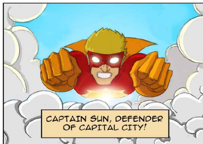
CAPTAIN SUN, DEFENDER OF CAPITAL CITY!

DID YOU KNOW THERE IS A REAL SUPER-POWERED HERO WHO WANTS TO RESCUE YOU? GRAB A BIBLE AND TAKE A LOOK AT THESE VERSES: PSALM 27:1-3; JOHN 3:16, 17; ROMANS 10:9, 13; 1 TIMOTHY 1:15; HEBREWS 2:14, 15.