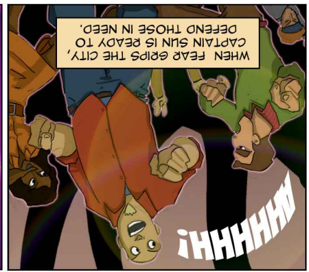
WHEN FEAR GRIPS THE CITY, CAPTAIN SUN IS READY TO DEFEND THOSE IN NEED.