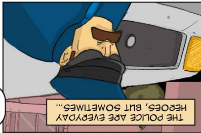
THE POLICE ARE EVERYDAY HEROES, BUT SOMETIMES...