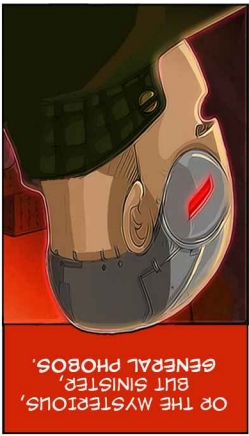
OR THE MYSTERIOUS, BUT SINISTER, GENERAL PHOBOS.