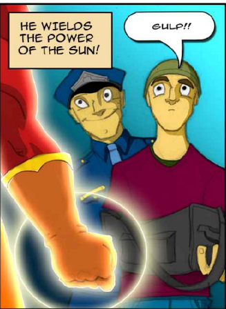
HE WIELDS THE POWER OF THE SUN!