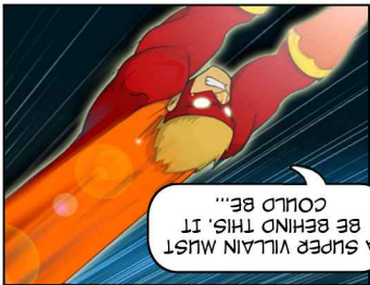
A SUPER VILLAIN MUST BE BEHIND THIS. IT COULD BE...