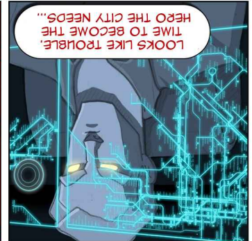
LOOKS LIKE TROUBLE. TIME TO BECOME THE HERO THE CITY NEEDS...