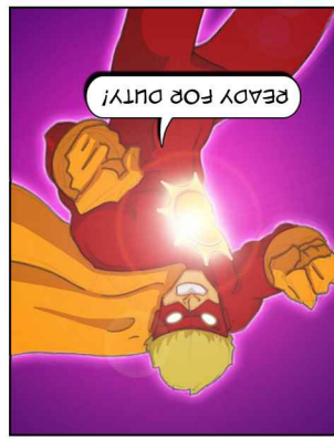
READY FOR DUTY!