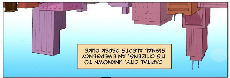
CAPITAL CITY. UNKNOWN TO ITS CITIZENS, AN EMERGENCY SIGNAL ALERTS DEERK DUKE.