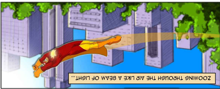
ZOOMING THROUGH THE AIR LIKE A BEAM OF LIGHT...